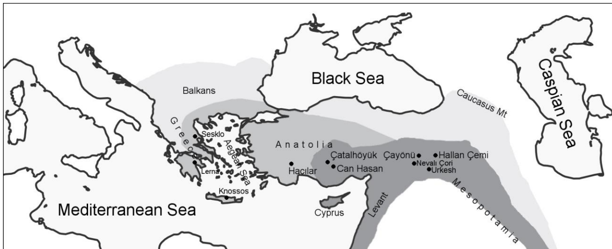
Map showing the initial expansion of farming and some important sites related to this research.