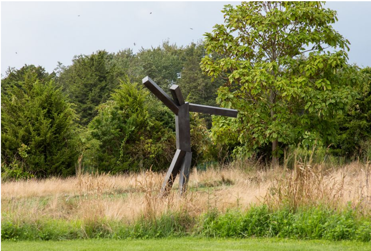
Joel Shapiro (American, born 1941), Untitled, 2014, Bronze, 120 x 100 x 50 inches, Courtesy of the artist and Kasmin Gallery, NY

Some artists work directly with metal to make a sculpture, using saws, nuts, bolts and heat to shape their work. Others will make sculptures from different materials such as clay or wax, even an existing object, and then make a mold of this first form to be cast in metal. It can be quite a process!