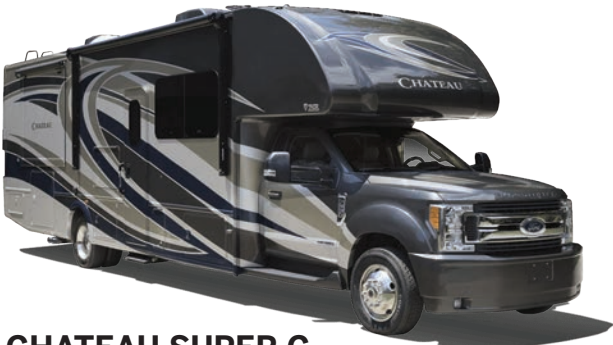
CHATEAU SUPER C