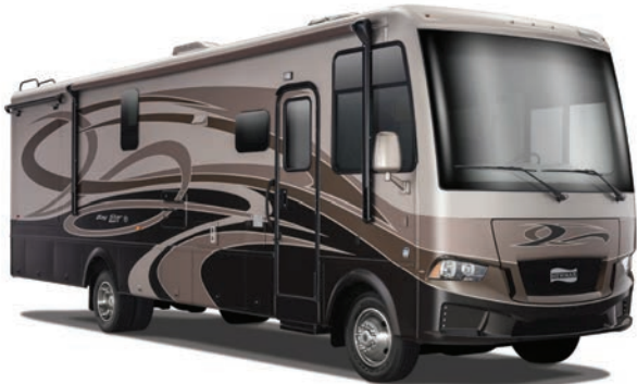
BAY STAR SPORT