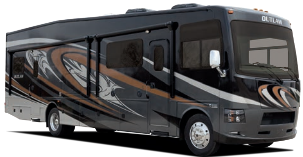
OUTLAW (TOY HAULER)