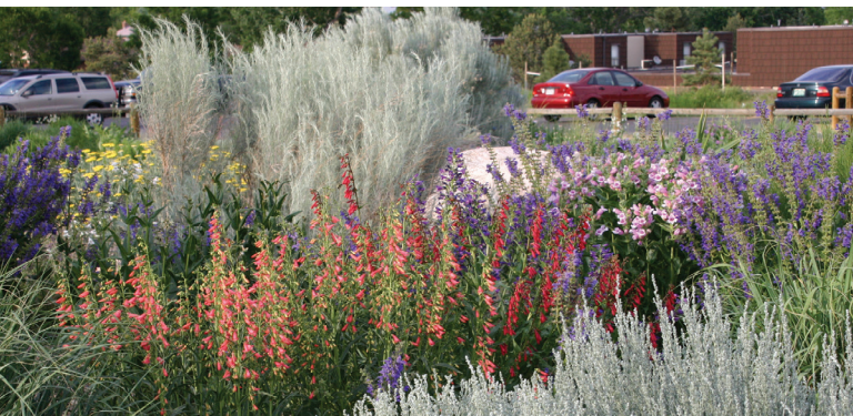
Kendrick Lake Gardens, Lakewood, Colorado

For more information, email horticulture@botanicgardens.org