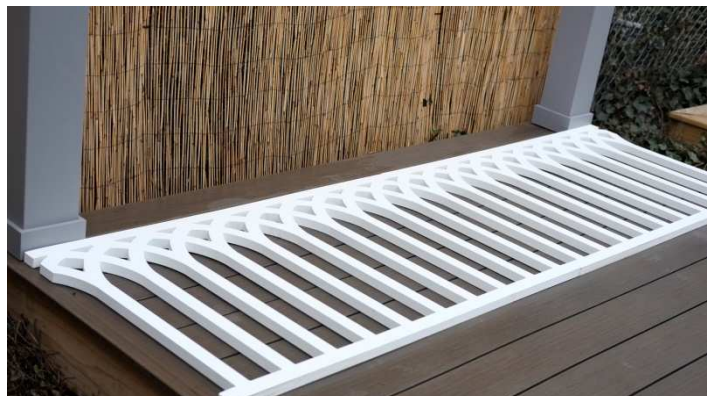
Photo shows 2 panels butted together and centered in opening – not yet cut to size

Cut panels to length as needed thinking about centering pattern in the opening.