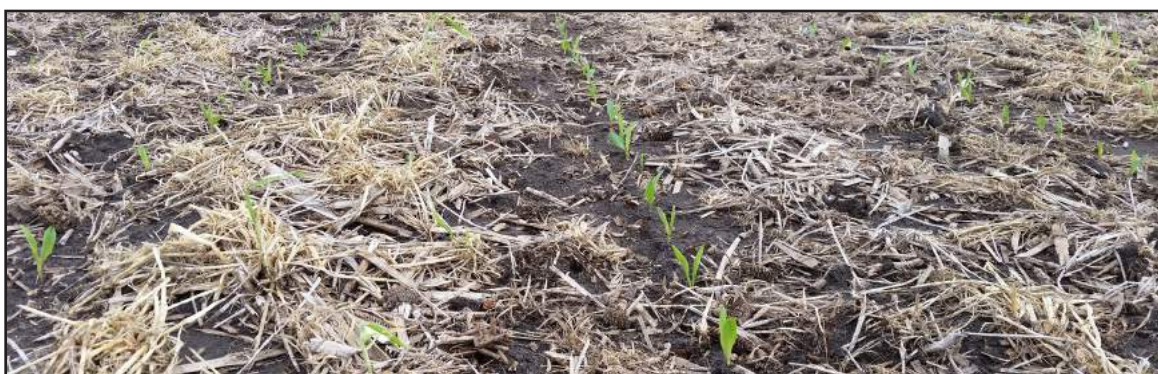
Corn emerging from a strip where the cover crop was terminated 21 days before planting corn on May 8 at Dick Sloan's. Photo taken on May 18.