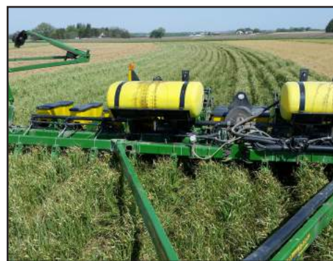
Dick Sloan planting corn into a strip where the cover crop was terminated 3 days prior. Strips on either side are those where the cover crop was terminated 21 days prior. Photo taken on May 8.

Data were analyzed using JMP Pro 12 (SAS Institute Inc., Cary, NC). Statistical significance is determined at the P \leq 0.05 level. Means separations are reported using Tukey's Least Significant Difference (LSD).