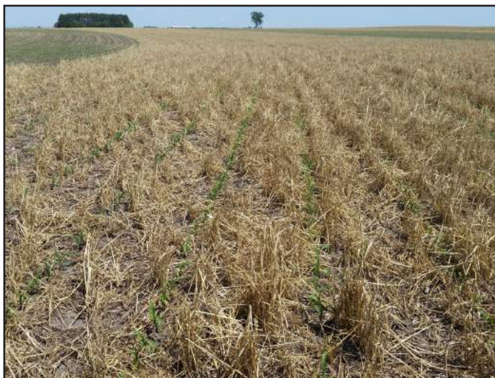
Corn emerging from a strip where the cover crop was terminated 3 days before planting corn on May 8 at Dick Sloan's. Photo taken on June 2.