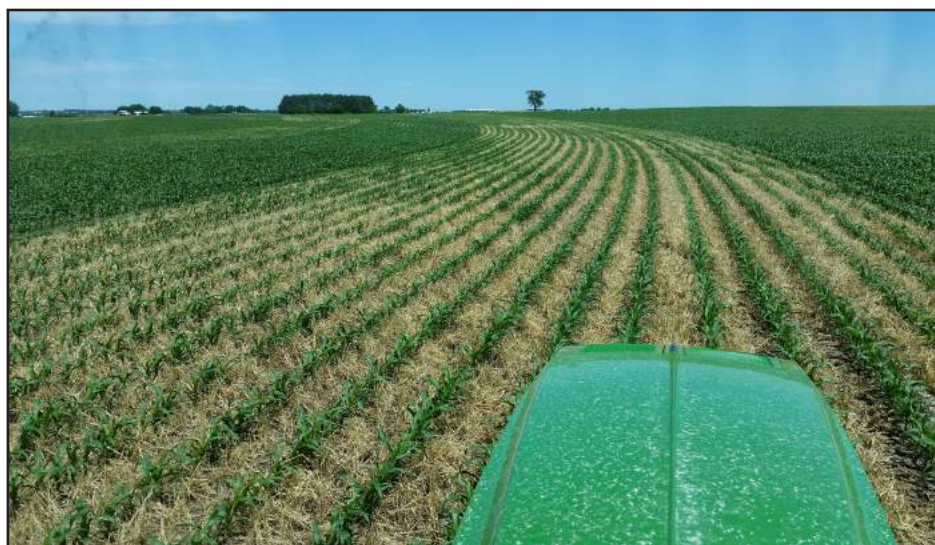
A strip at Dick Sloan's where the cover crop was terminated 3 days before planting corn on May 8. Photo taken on June 15 during side-dress N application.

Recent work by Practical Farmers of Iowa (Gailans et al., 2014) and researchers at Iowa State University (Pantoja et al., 2015)