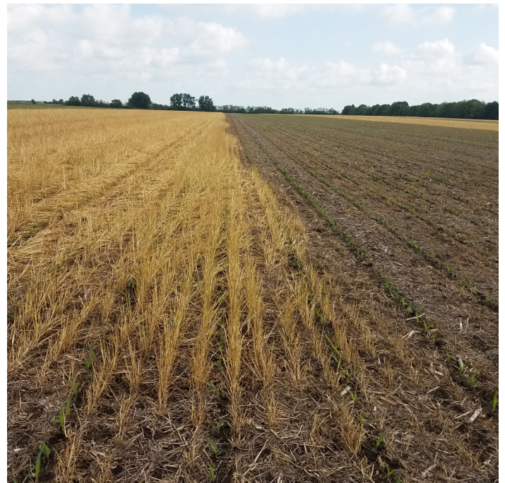
At left, cereal rye cover crop that was terminated on the same day as planting corn (May 8). At right, cereal rye cover crop that was terminated 14 days before planting corn (Apr. 26). Photo taken May 21, 2018.

Kauffman seeded the cereal rye cover crop on Oct. 15, 2017 at a rate of 70 lb/ac using a drill. The first cover crop termination date occurred on Apr. 23, 2018 (15 DBP) with an application of glyphosate (48 oz/ac) and 2,4-D (8 oz/ac). The second termination date occurred on May 8 (0 DBP; same day as planting corn) with an application of glyphosate (32 oz/ac). Kauffman collected biomass samples of the cover crop just prior to either termination date that were dried and weighed. Corn was planted in both treatments on May 8 at a rate of 30,500 seeds/ac. Nitrogen fertilizer was applied at a rate of 71 lb N/ac as UAN at the time of planting. Pest control consisted of Stalwart (herbicide) applied at 96 oz/ac and Lorsban (insecticide) applied at 4 oz/ac on May 9. On May 31, Dr. Alison Robertson and Jyotsna Acharya from the ISU Department of Plant Physiology and Microbiology collected corn seedling samples from each strip and assessed them for incidence of disease (root rot). A side-dress N fertilizer application of 50 lb N/ac as