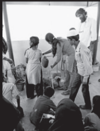
< The tippy tap gets installed

Pratham Books also gave away prizes to the winners of Pratham Books' Conserve Our Rivers, Save Water campaign which was launched in October 2009 to mark the publication of the book. The campaign called upon students, teachers, bloggers and others to sign up to become Water Champions. Over 1, 22,000 pledges were received from people all over the country saying they would save water. The campaign was carried out in partnership with Arghyam and Deccan Herald's student programme, DHNIE.