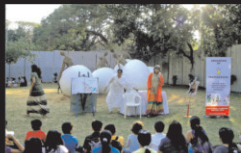
Ratna Pathak Shah at the Kala Ghoda Festival

World Storytelling Day with kids from the Akshara library in Bangalore and kids from Central Manor, Pennsylvania. The event aimed at allowing kids from both countries to share stories and learn about different cultures.