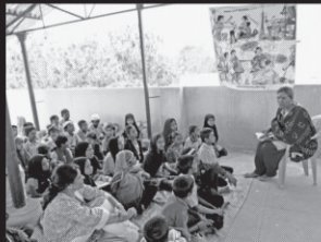
v Book reading at the event