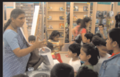
Children learn how to make salt at an activity by Pratham Books