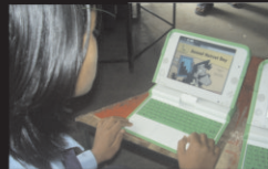
Our books on the OLPC project, Nepal