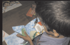
Enjoying our tamil books in Yercaud, Tamil Nadu