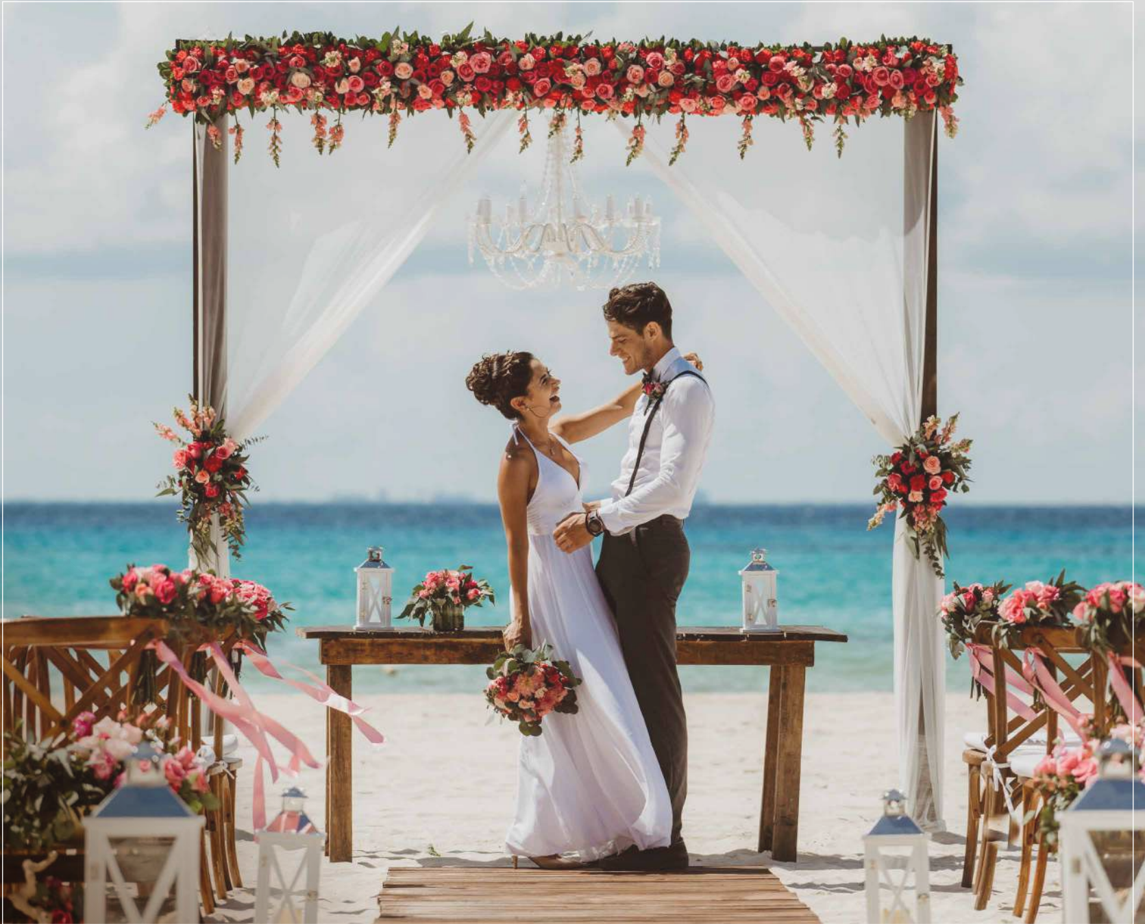
Illustrations may depict upgraded setups.