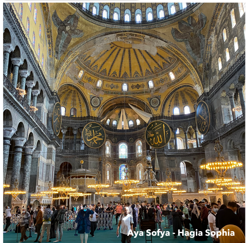
Aya Sofya - Hagia Sophia

Istanbul has been called the Heart of the World. At the crossroads between East and West, straddling Europe and Asia, this ancient city is a true melting pot of cultures, religions and worldviews. The Latin Catholic presence in this part of Turkey is small but historically important. The Church makes a vibrant contribution to the colorful landscape of faith, hope and charity that have made this city and country a destination for pilgrims, travelers, traders and adventure seekers for centuries.