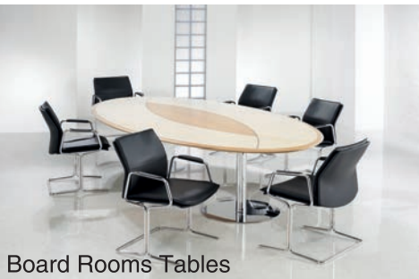
Board Rooms Tables