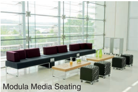
Modula Media Seating