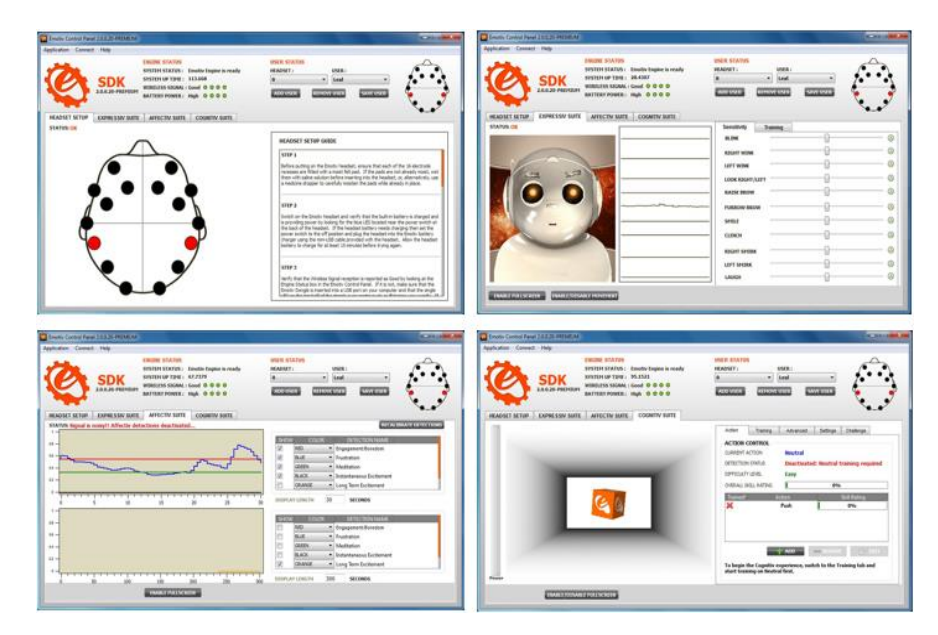
Fig. 1. Emotiv EPOC suite's interfaces.

Emotiv EPOC is a brain-computer interface, created by Emotiv Systems. It is used in researching applications and contains three components named "suites" to process the signals: Expressive suite, Cognitive suite, and Affective suite.