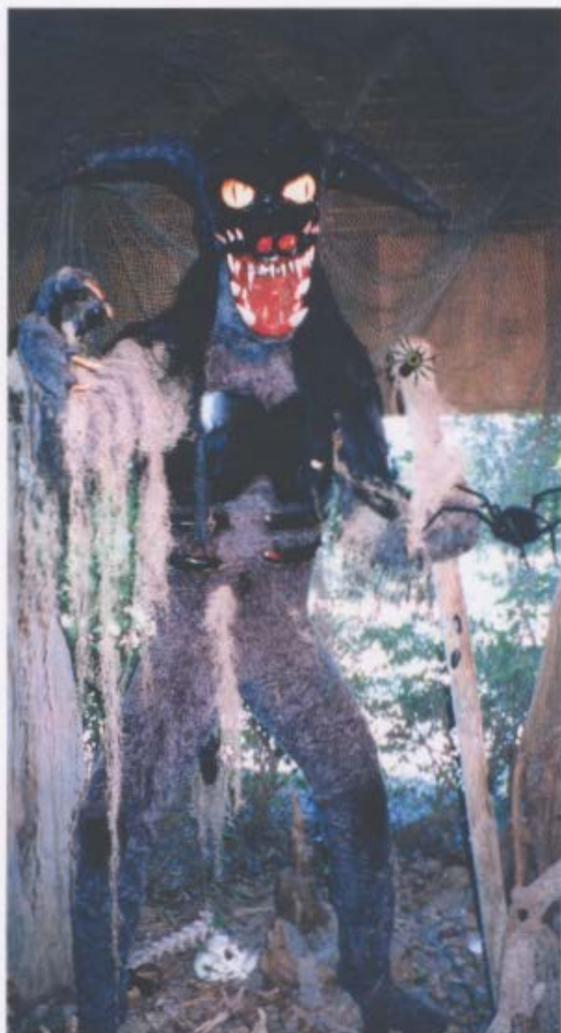
Photograph 3: Audubon Zoo Display