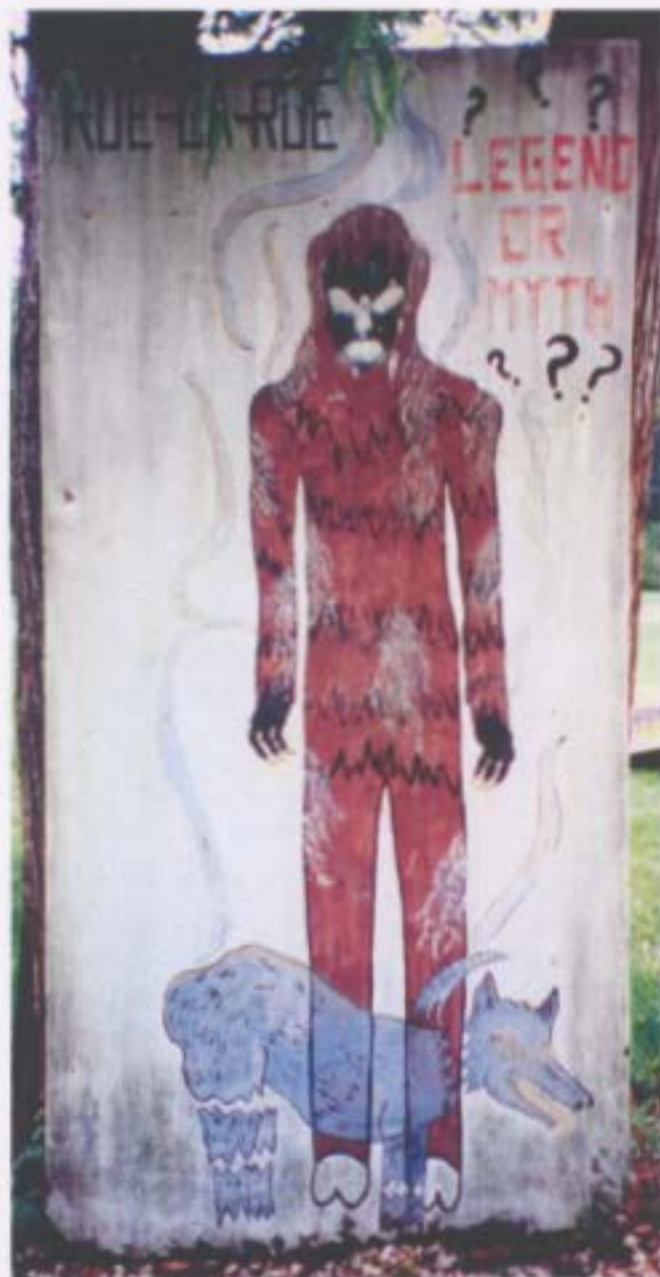
Photograph 4: Rue-Ga-Rue Display, Cajun Pride Swamp Tours