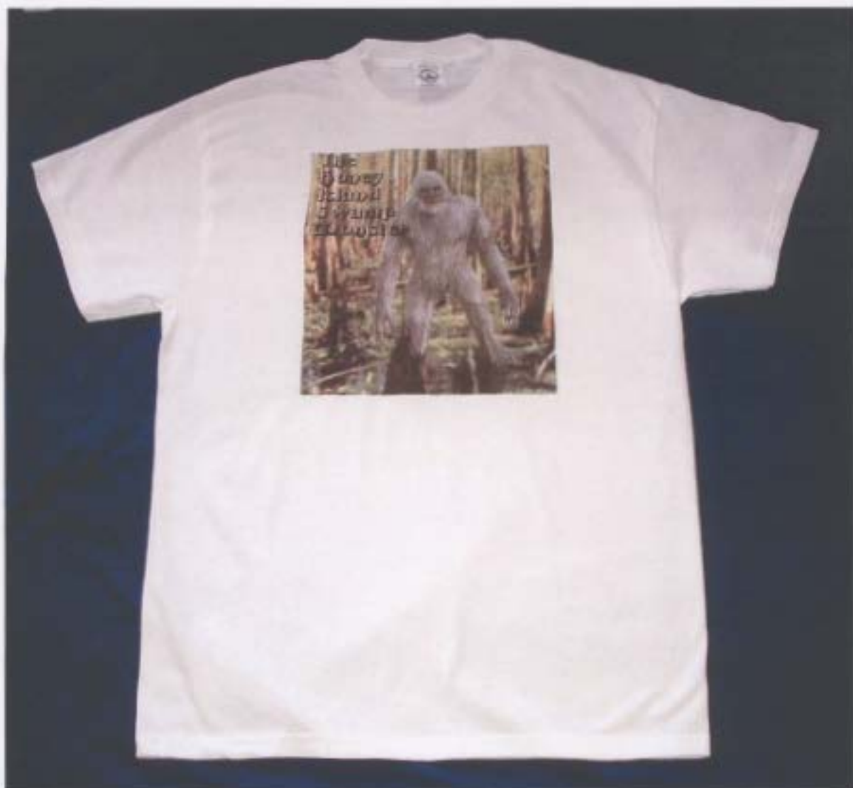
Photograph 5: Honey Island Swamp Monster T-Shirt Designed by Bill Asmussen