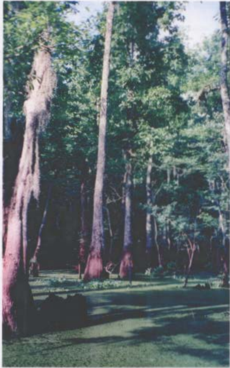
Photograph 1: The Honey Island Swamp