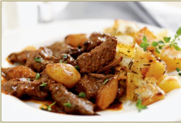
Beef and Potatoes Slow simmered beef and tender potatoes cooked in beef stew