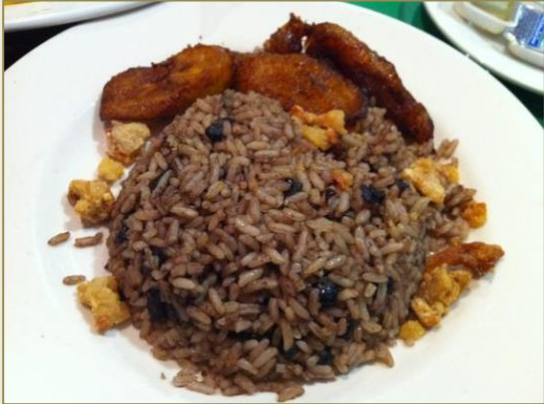
Black Bean Rice / Moro Rice mixed with black beans seasoned with herbs and spices