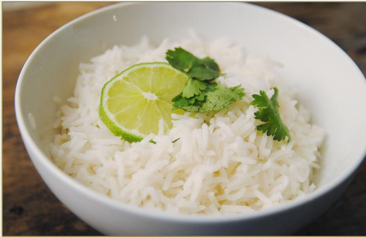
White Rice / Arroz Blanco Steamed white rice