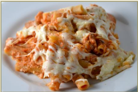
Baked Ziti Penne pasta baked with ground beef, hearty tomato sauce and mozzarella cheese