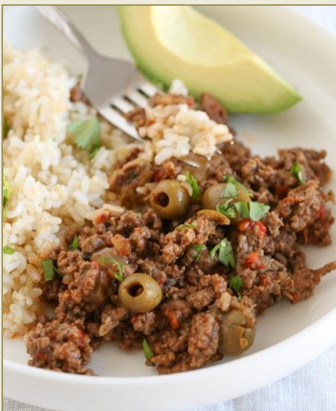
Ground beef / Picadillo Slow cooked ground beef mixed with olives, garlic and red peppers