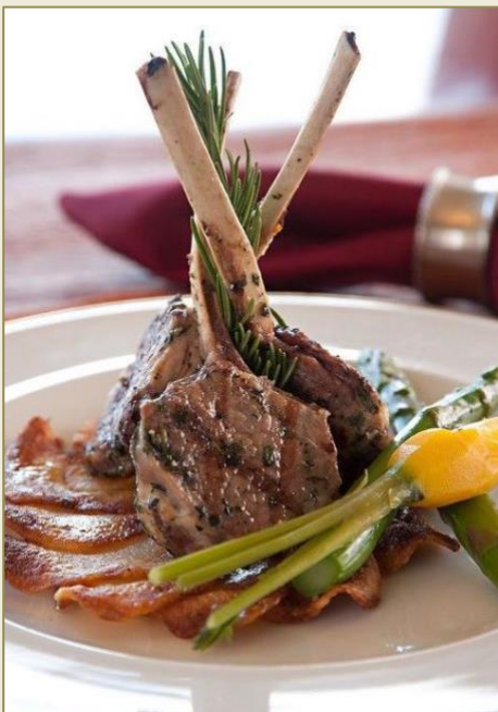
*Rack of Lamb Roasted rack of lamb marinated in garlic and fresh herbs