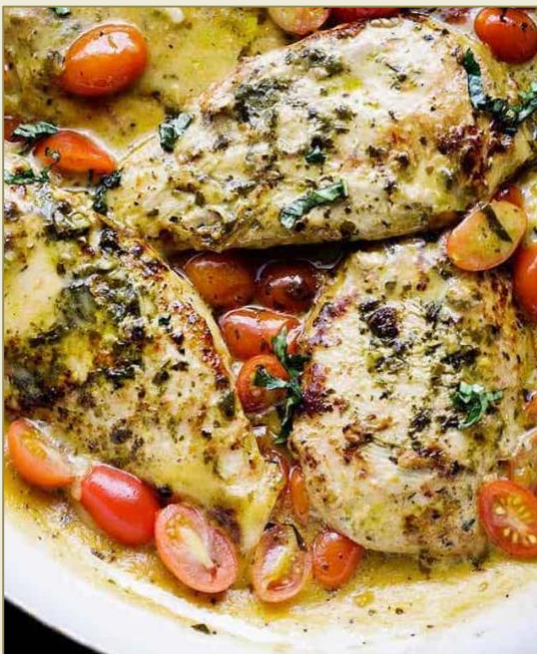
Pesto Chicken Boneless, skinless chicken breast with basil pesto, grape tomatoes and cheese