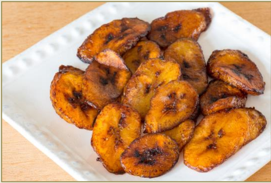
Sweet Plantain / Platano Maduros Fried sweet plantains