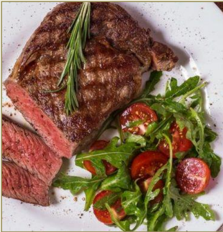
*Pan seared sirloin steak marinated in wine, butter and garlic perfectly pan seared to serve