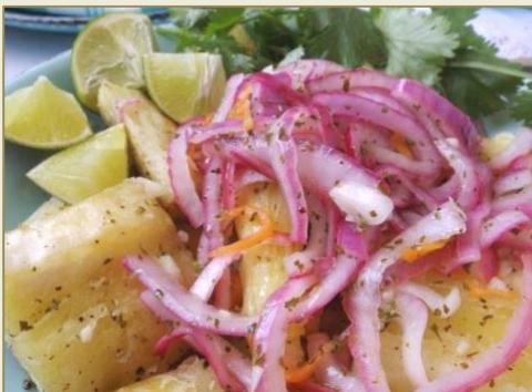
Yucca with Mojo Yucca with garlic, lemon, herb mojo sauce