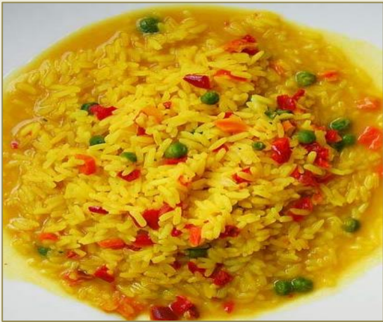
Yellow Rice / Arroz Amarillo Yellow rice with mixed vegetables and bell peppers