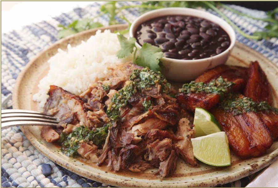
Cuban Style Roast Pork / Lechon Asado Tender boneless roasted pork marinated in juicy Cuban mojo garlic