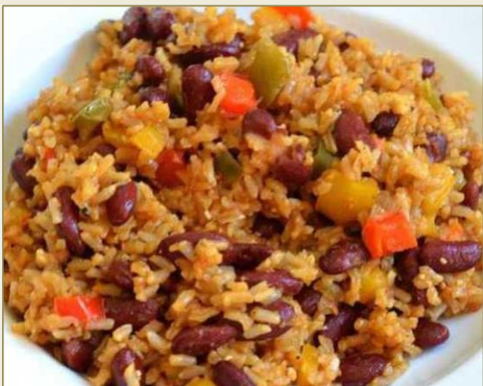
Brown rice and red beans Steamed brown rice with red kidney beans, green and bell peppers