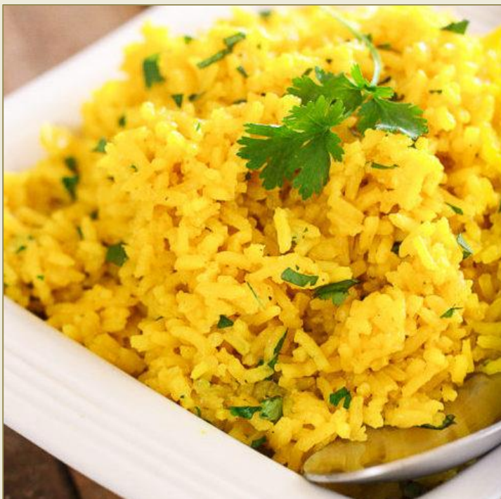
Yellow rice Steamed yellow rice with peas and carrots