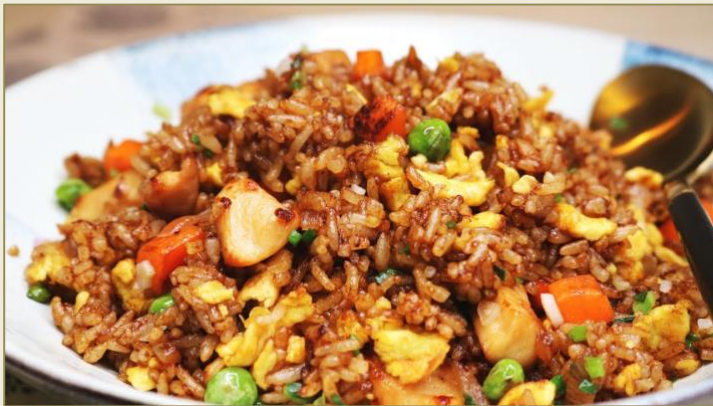
Chinese Rice Stir fried rice with diced carrots, peas, bits of scrambled eggs, sprouts, onions mixed with choice of chicken, barbecued pork or ham