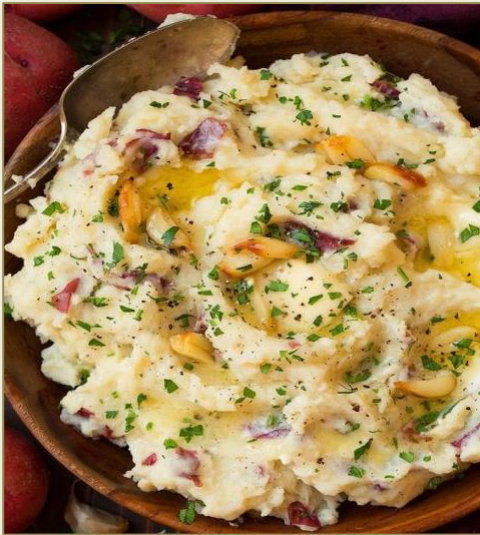
Garlic Mash Potato's / Pure de Papa con Ajo Boiled potato's mashed with minced garlic, butter and chives

Upcharge may apply on items with an * next to it