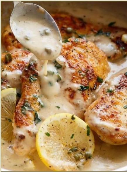
Creamy chicken piccata lemon parmesan Garlic, lemon butter marinated chicken topped with capers, creamy lemon herb piccata sauce

Upcharge may apply on items with an * next to it