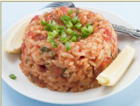
Mediterranean Rice Rice mixed with diced tomato, garlic, pepper, onion, herbs and spices