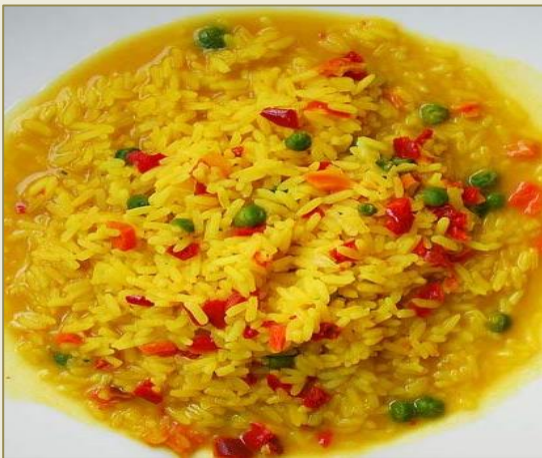
Yellow Rice / Arroz Amarillo Yellow rice with mixed vegetables and bell peppers