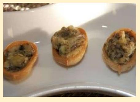
Escargot Bourguignon On Mini Phyllo Tartlet