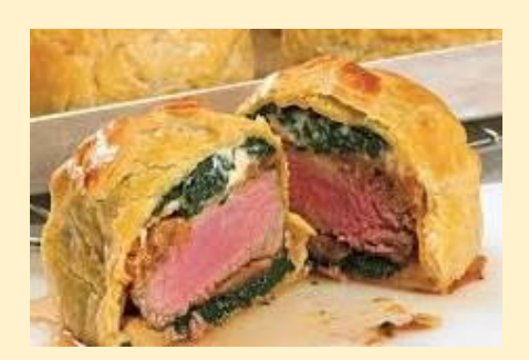
Petite Filet Mignon sundried tomatoes with béarnaise