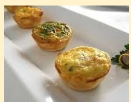
Mini Quiche – spinach, cheese, ham and other assorted delights