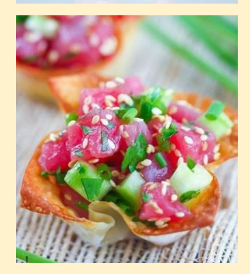
Tuna Tartar on a crispy wonton