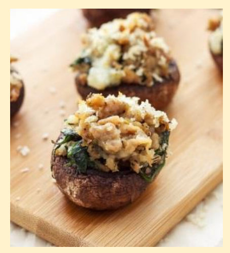
Mushrooms stuffed with goat cheese, spinach and proscuitto