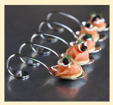
Canape of Salmon with a touch of caviar