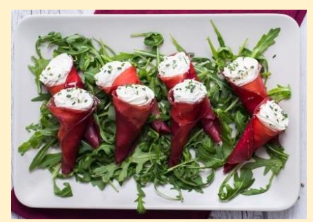
Bresaola antipasto wrapped with herbs and goat cheese on arugula