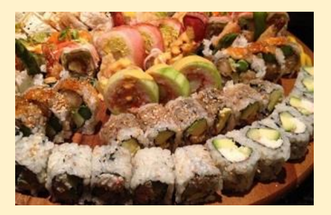
Assorted sushi rolls with ginger & soy sauce