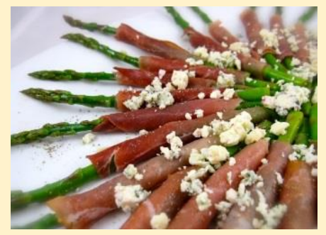
Prosciutto-wrapped asparagus with crumbled blue cheese