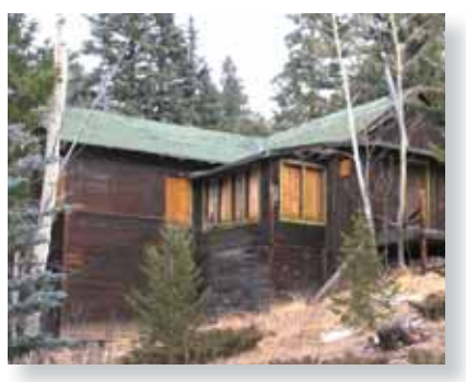
Wigwam Tea Room before restoration

As stewards of history, the Rocky Mountain Conservancy already has restored many significant buildings.