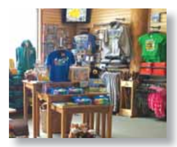
Members enjoy a 15% discount at all Conservancy Nature Stores in the park

Conservancy members treasure Rocky Mountain National Park. We keep our members informed about park issues and park events and provide ways for them to stay connected to this beautiful place.