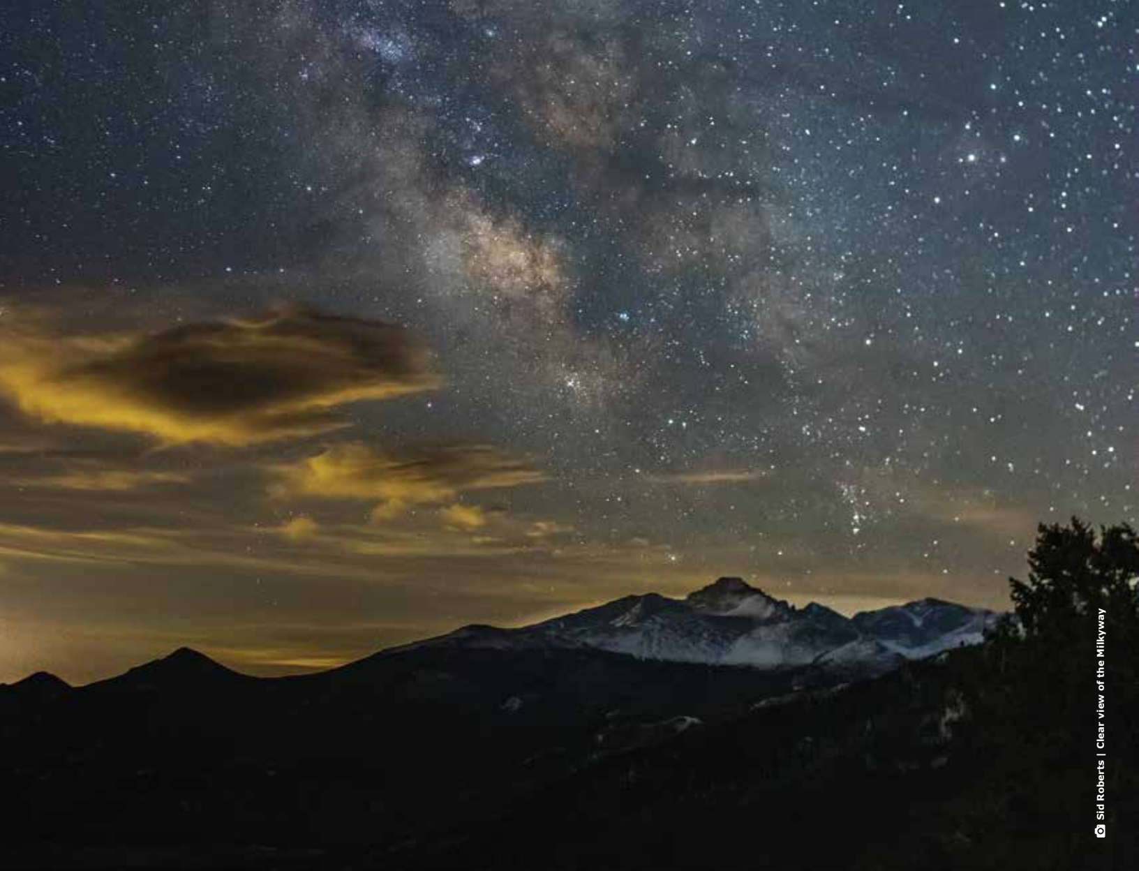
Sid Roberts | Clear view of the Milkyway