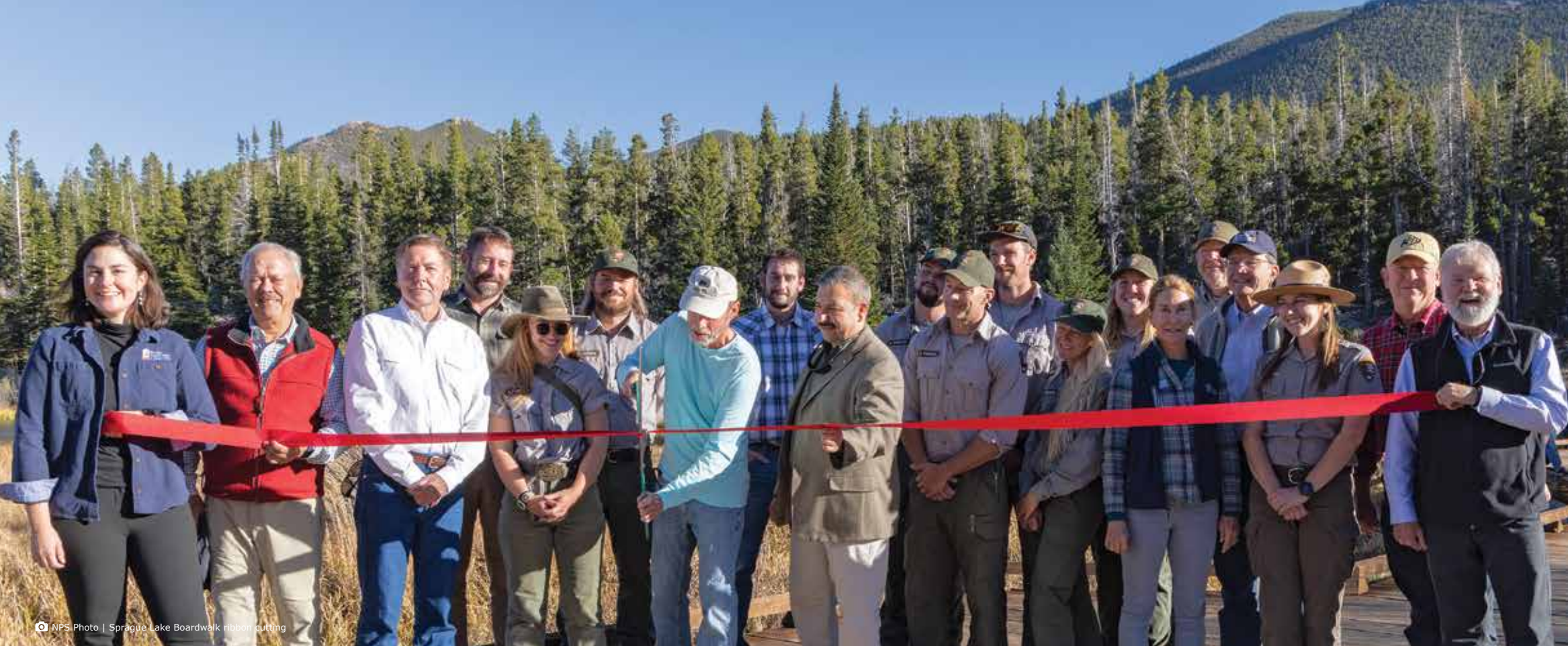
Sprague Lake Boardwalk ribbon cutting