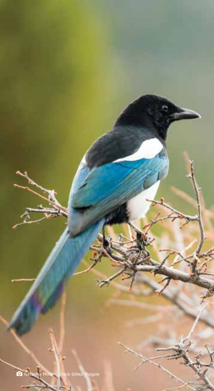
© Natasha Miller | Black-billed Magpie