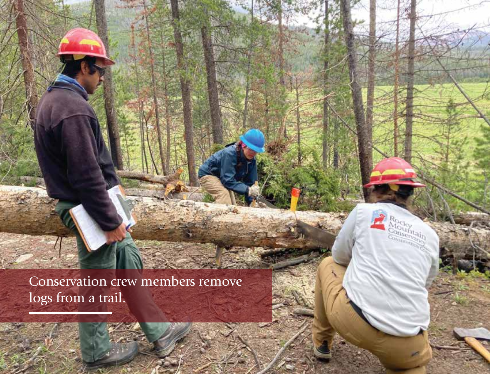
Conservation crew members remove logs from a trail.