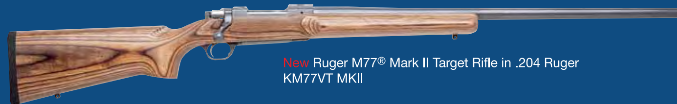
New Ruger M77® Mark II Target Rifle in .204 Ruger KM77VT MKII