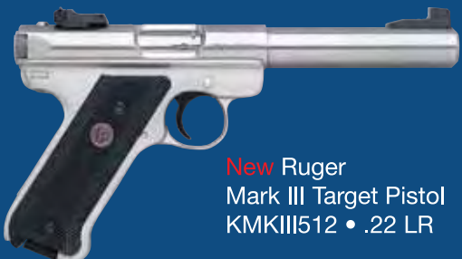
New Ruger Mark III Target Pistol KMKIII512 • .22 LR