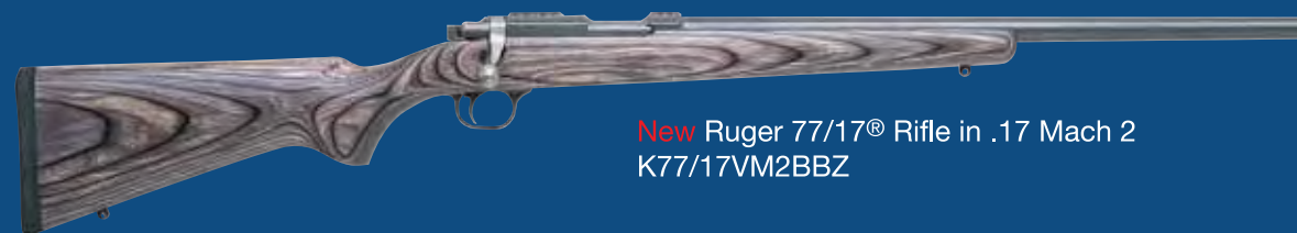
New Ruger 77/17® Rifle in .17 Mach 2 K77/17VM2BBZ