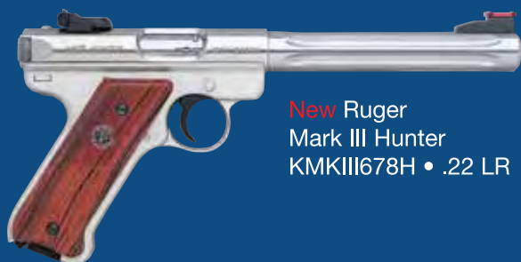
New Ruger Mark III Hunter KMKIII678H • .22 LR