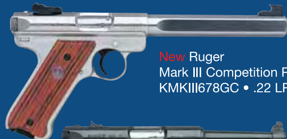
New Ruger Mark III Competition Pistol KMKIII678GC • .22 LR