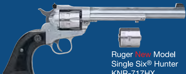
Ruger New Model Single Six® Hunter KNR-717HX .17 HMR/.17 Mach 2