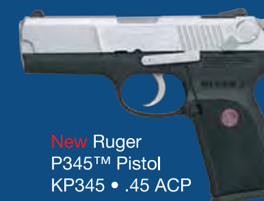
New Ruger P345™ Pistol KP345 • .45 ACP