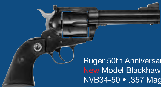
Ruger 50th Anniversary New Model Blackhawk® NVB34-50 • .357 Mag.