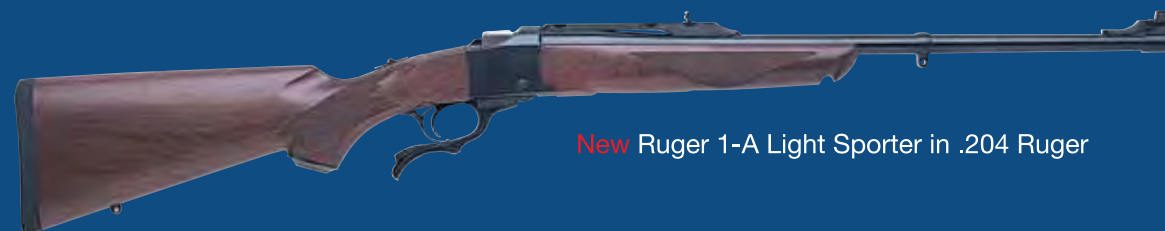
New Ruger 1-A Light Sporter in .204 Ruger