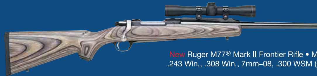
New Ruger M77® Mark II Frontier Rifle • M77FRBBZ MKII .243 Win., .308 Win., 7mm-08, .300 WSM (scope not included)