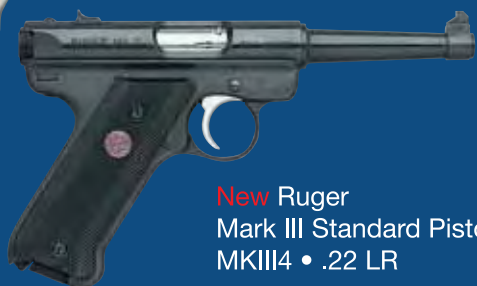
New Ruger Mark III Standard Pistol MKIII4 • .22 LR