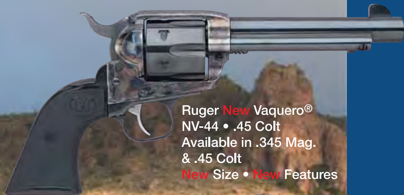
Ruger New Vaquero® NV-44 • .45 Colt Available in .345 Mag. & .45 Colt New Size • New Features