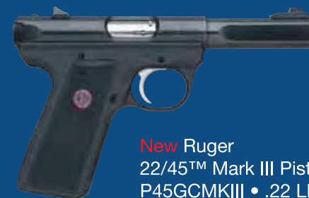
New Ruger 22/45™ Mark III Pistol P45GCMKIII • .22 LR