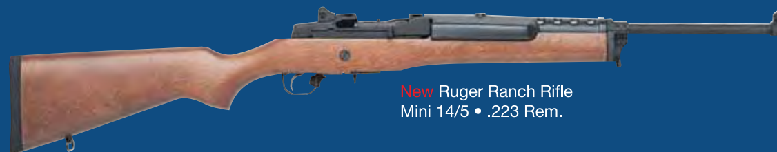
New Ruger Ranch Rifle Mini 14/5 • .223 Rem.