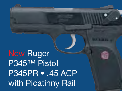
New Ruger P345™ Pistol P345PR • .45 ACP with Picatinny Rail