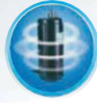
Famous brand compressor