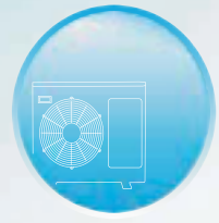
Galvanized sheet with anti-rust layer