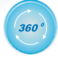
360° 3-D blowing