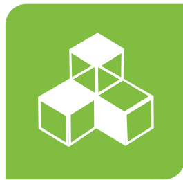
INDUSTRY, INNOVATIONS AND INFRASTRUCTURE