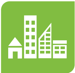
SUSTAINABLE CITIES AND COMMUNITIES