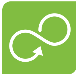
RESPONSIBLE CONSUMPTION AND PRODUCTION