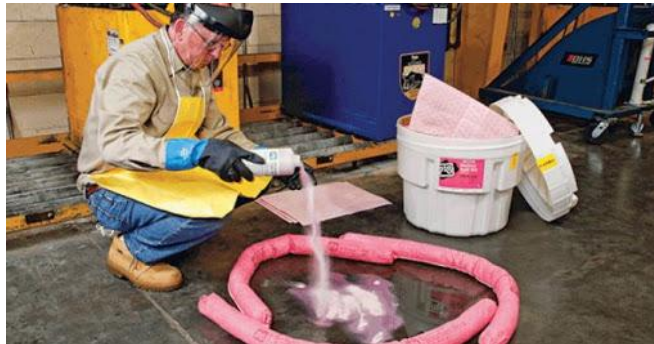
Chemical absorbent with socks