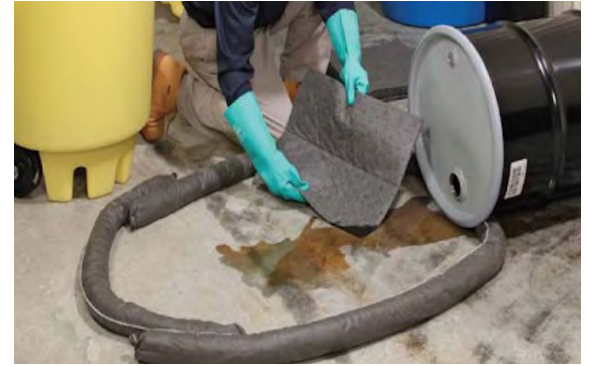
Absorbent pad with socks/booms