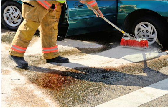
Oil absorbent with broom