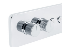
2 Outlet/ 2 Handle Thermostatic Shower Mixer 3/4" BDM-SFM-T302-XX

FINISHES: Replace XX with colour suffix when ordering