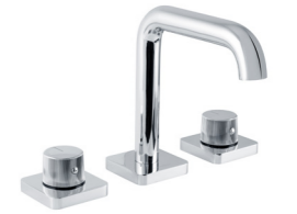
3 Hole Deck Mounted Basin Mixer without Waste BDM-SFM-303-XX