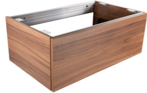
Wall Mounted Storage Unit 800 x 485 x 300 mm BDF-SFM-080-XX