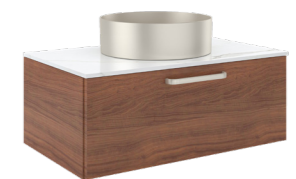
COMPOSITION STEREO FM B Single Storage Unit 800 mm