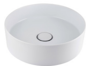
Countertop Wash Basin Dia. 405 x 120 mm BDS-CIR-101-XX Waste required - BDP-WBB-304-XX