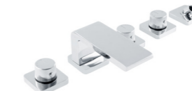
5 Hole Deck Mounted Basin Mixer without Hand Shower BDM-SFM-452-XX