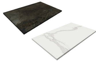
Countertop 804 x 495 x 20 mm BDF-SFM-C080-XX