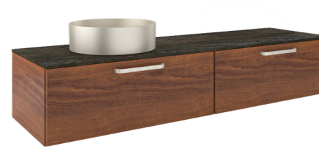
COMPOSITION STEREO FM C Combination of Two (2) Vanity Units