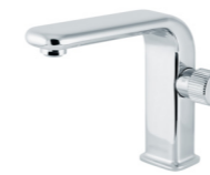
Mono Basin Mixer without Waste BDM-SFM-301S-XX