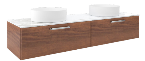
COMPOSITION STEREO FM D Combination of Two (2) Vanity Units