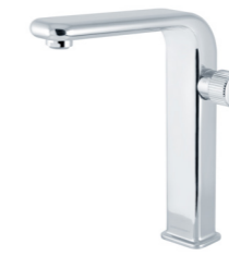
Mono Tall Basin Mixer without Waste BDM-SFM-302S-XX