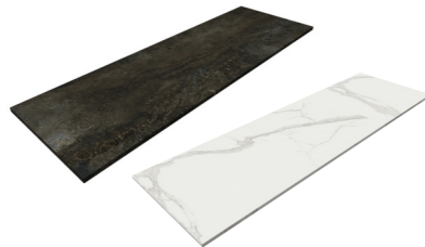
Countertop 1604 x 495 x 20 mm BDF-SFM-C160-XX