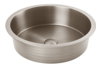
Undercounter Wash Basin Stainless Steel with waste Dia. 442 x 106.5 mm BDS-SFM-601-XX

FINISHES: Replace XX with colour suffix when ordering