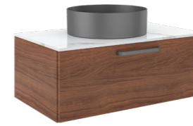
COMPOSITION STEREO FM A Single Vanity Unit 800 mm