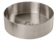
Countertop Wash Basin Stainless Steel with waste Dia. 400 x 120 mm BDS-SFM-701-XX