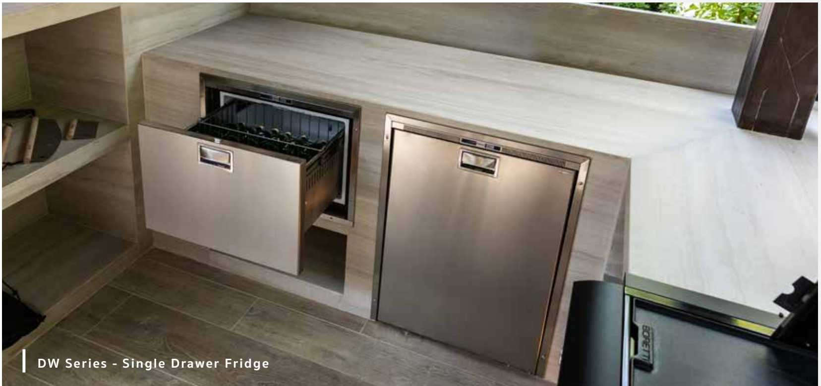
DW Series - Single Drawer Fridge

This modern take on stainless-steel kitchen appliances takes functionality and styling to new heights. Sleek, spacious drawers and handles designed with easy accessibility in mind make these new-age fridges a durable choice without compromising on quality or efficiency.