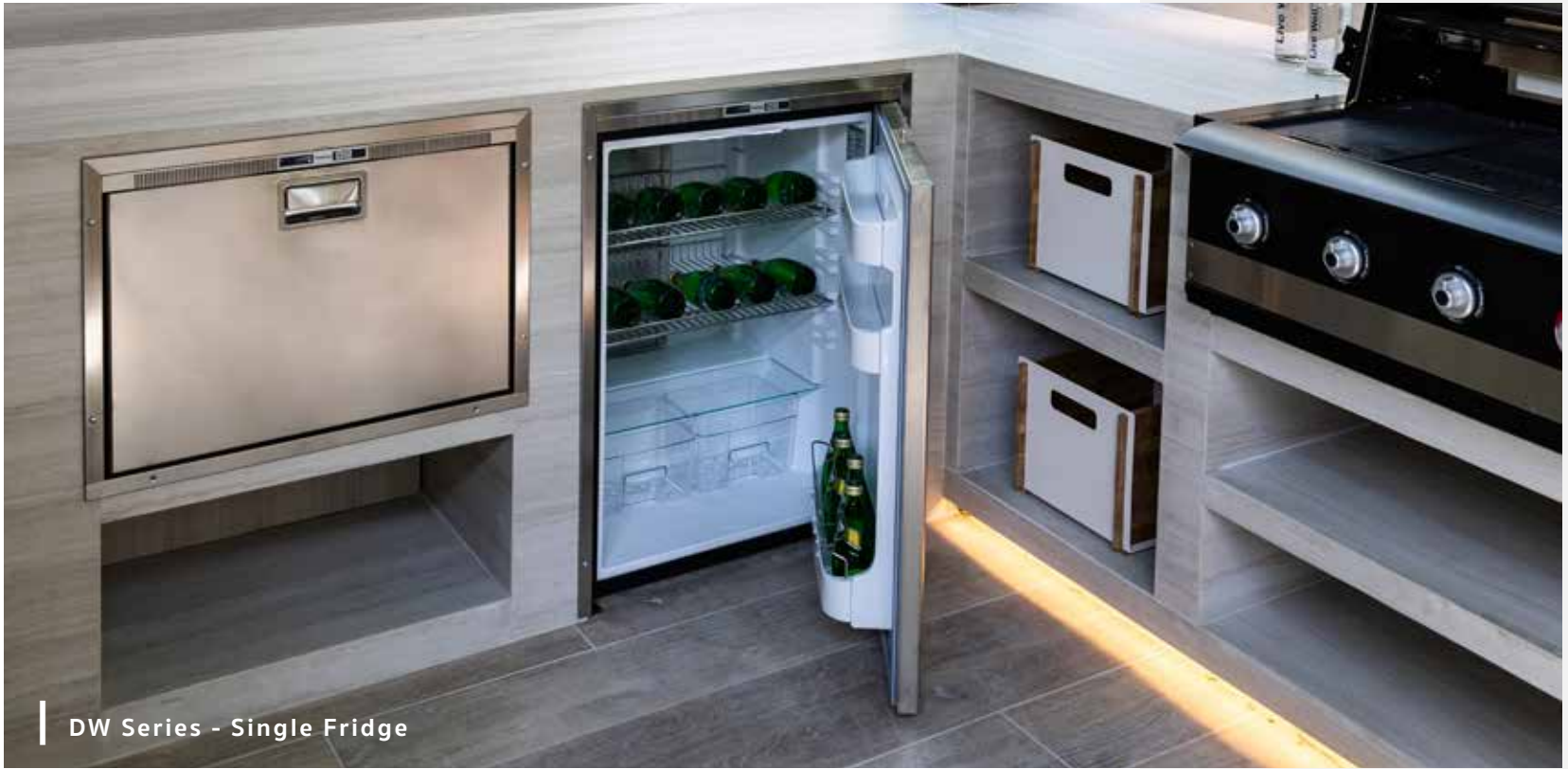
DW Series - Single Fridge