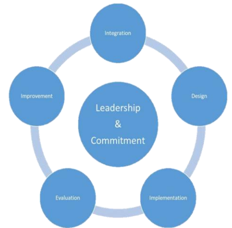
Figure 1—Elements of an Effective Risk Management Framework