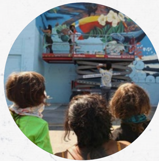
View Live Mural Painting