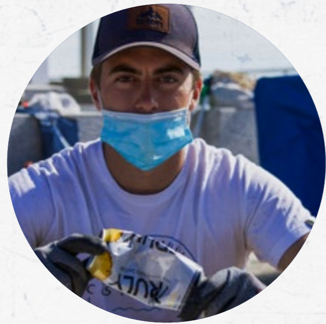
Beach and Harborwalk Cleanups