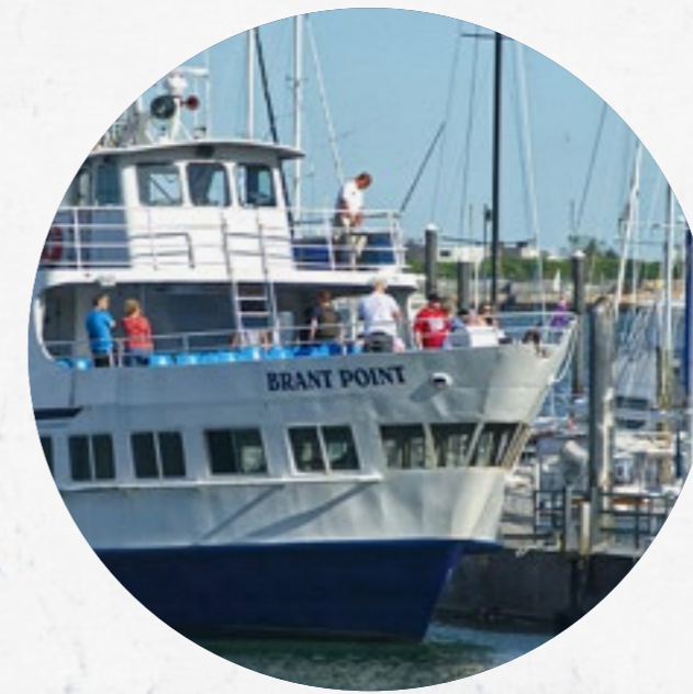
Cultural and Environmental Excursions