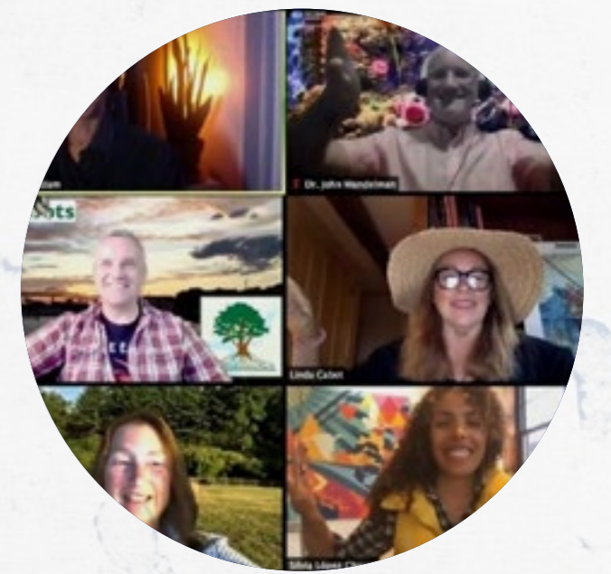
Virtual Panel Discussions and IG Lives with Artists