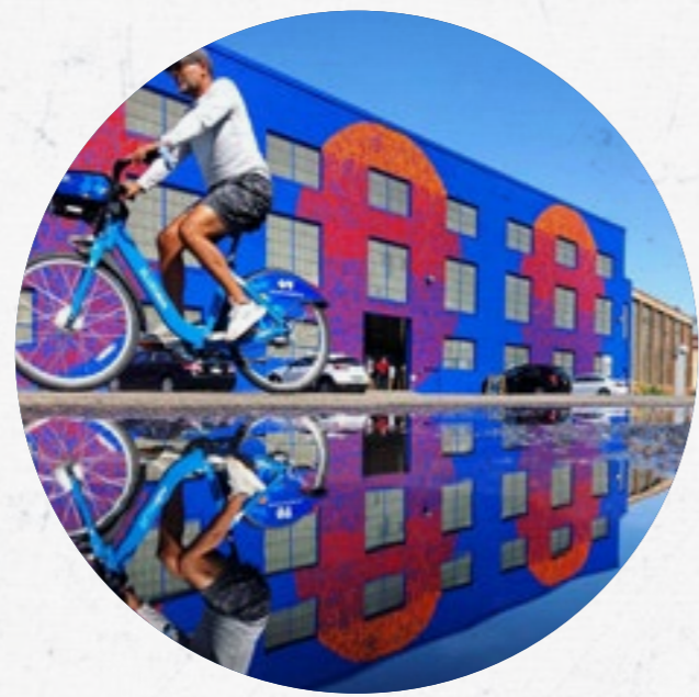
Mural Walks & Bike tours