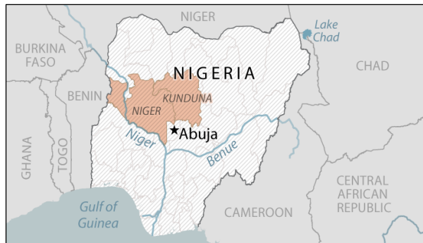
Figure 2. Nigeria's Niger and Kaduna States