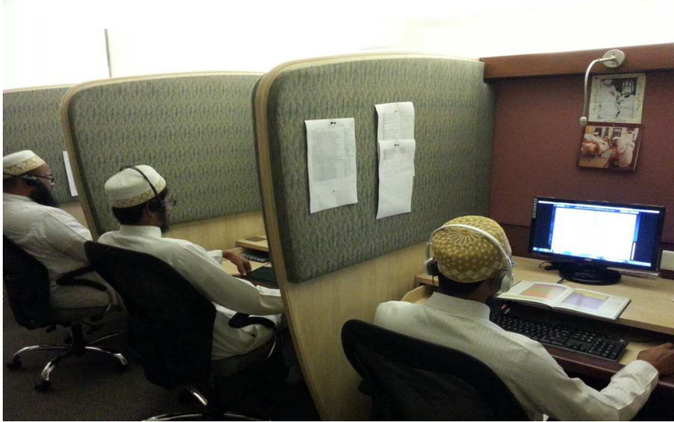
Pic. Elearning system of Qur'an