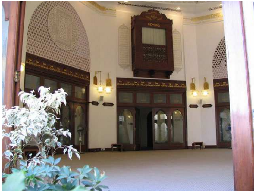
Mahad-al-Zahra (Inside view-Hall)

The management of these Quran memorization camps is such that it gives an opportunity to every boy and girl attending it, not only to memorize Qur'an but also teaches how to manage time for the other priorities of life. In a short period of time they may develop the confidence that memorization of Qur'an is not an impossible job. It might be a bit hectic to those who lead a sedentary life.