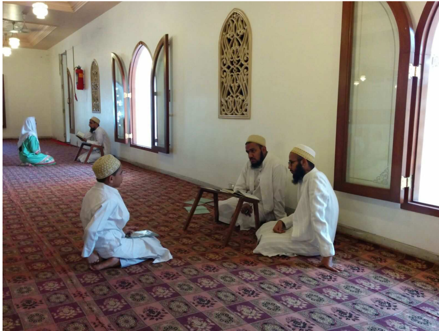
Pic. Atfaal classes

The same procedure of Murajaah, Juzhaali, Jadeed and Tasmee is followed.