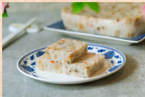
RADISH CAKE WITH PRESERVED MEAT 金牌腊味萝卜糕