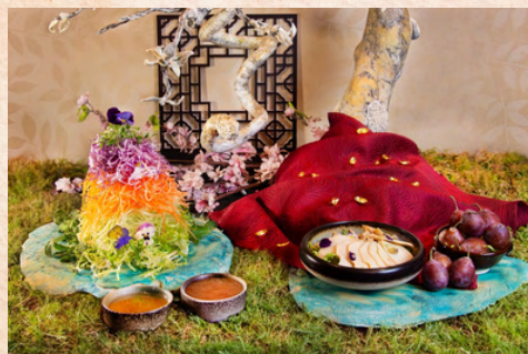
XIN'S 2-HEAD ABALONE YU SHENG 二头鲍鱼捞起