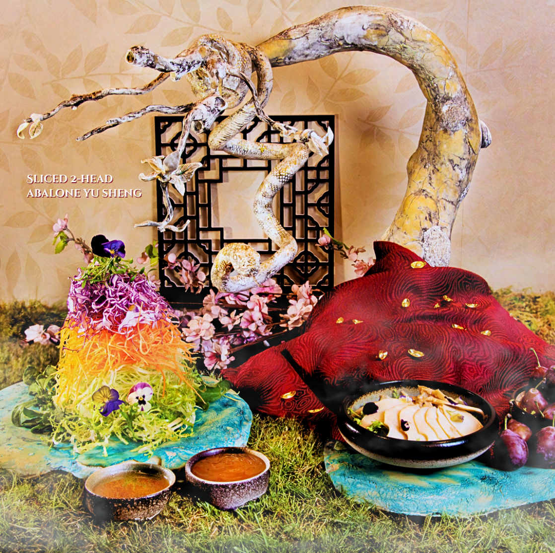
SLICED 2-HEAD ABALONE YU SHENG