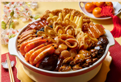
TRADITIONAL PEN CAI 合家欢传统盆菜