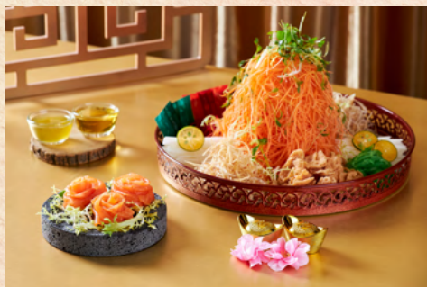
XIN'S SALMON YU SHENG 新故乡鸿运三文鱼捞起

Feast on luxurious classics to kick-start a bountiful year with perennial favourites brimming with premium ingredients. Huat ah!