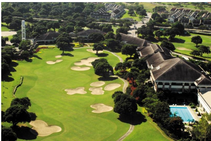
Exhibit 1: Orchard Golf and Country Club