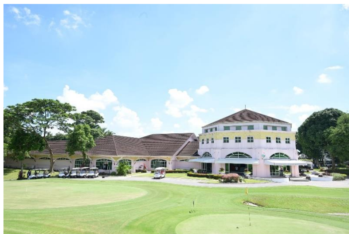
Exhibit 2: Eagle Ridge Golf and Country Club