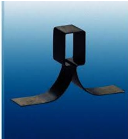
FIGURE 1 – Uplift Prevention Clips Details

Uplift Prevention clips are permitted but not required. Figure 1 of this report provides a detail of the clip.