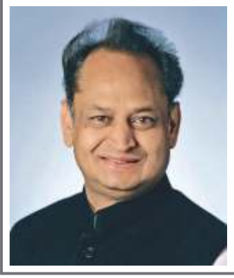
ASHOK GEHLOT Chief Minister, Rajasthan

I am glad to know that the Rajasthan Industrial Development Policy- 2019 is being released at MSME Conclave 2019 to be held at Birla Auditorium, Jaipur to mark the completion of one year of the State Government.