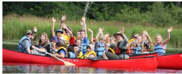
Halifax Regional Municipality Recreation and Shubenacadie Canal Commission partner for Summertime Outdoor Adventure Day Camps

An exciting series of outdoor summer adventure camps in the heart of Dartmouth, Shubenacadie Park! Programming includes canoe adventures, map and compass discovery, living history like an early explorer, and environmental learning for children and youth ages 6-14. Contact Recreation Programming at 902.490.4728 or visit halifax.ca/rec for more information.