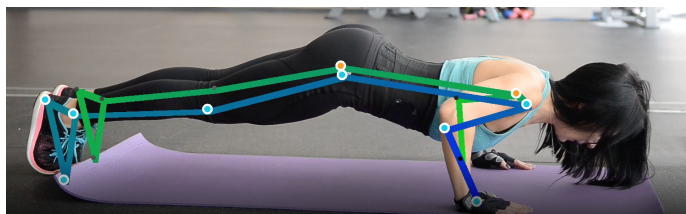
Depth is encoded via gradient from blue (closer) to green (further). Invisible (occluded) keypoints marked as black.

Lite (3MB size), Full (6 MB size) and Heavy (26 MB size) models, to estimate the full 3D body pose of an individual in videos captured by a smartphone or web camera . Optimized for on-device, real-time fitness applications : Lite model runs ~44 FPS on a CPU via XNNPack TFLite and ~49 FPS via TFLite GPU on a Pixel 3. Full model runs ~18 FPS on a CPU via XNNPack TFLite and ~40 FPS via TFLite GPU on a Pixel 3. Heavy model runs ~4 FPS on a CPU via XNNPack TFLite and ~19 FPS via TFLite GPU on a Pixel 3.