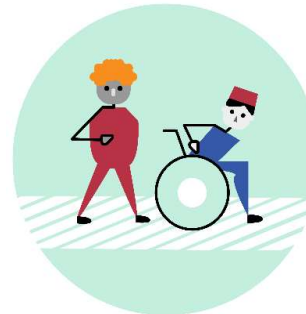
Active transportation choices