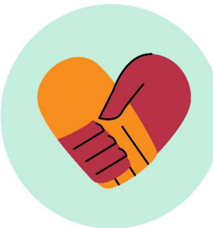
Community & cultural space