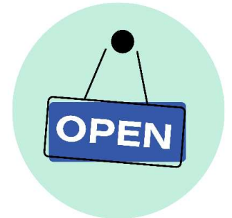
Focused commercial areas