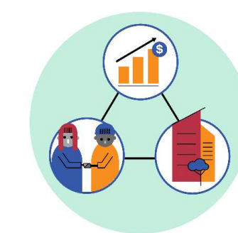
Small business & good jobs