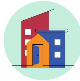
New housing choices