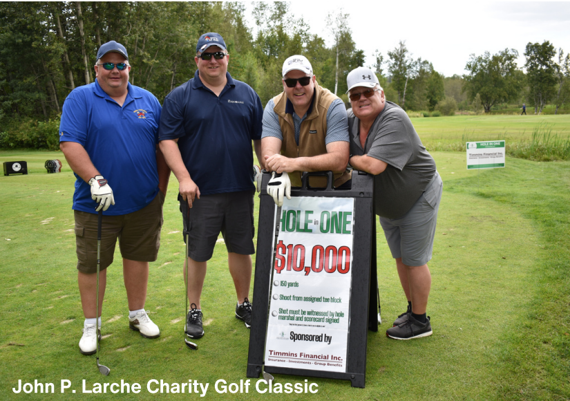
John P. Larche Charity Golf Classic

Dueling Pianos, John P. Larche Charity Golf Classic and Dancing with the Docs give the Foundation team the opportunity to foster stronger relationships with our donors, sponsors, and volunteers. By participating, you are supporting crucial advancements that will greatly improve the healthcare services offered at the Timmins and District Hospital.