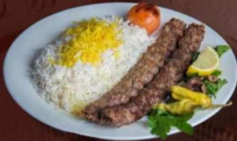
CHELO KEBAB KOOBIDEH