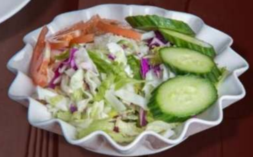
FRESH GREEN SALAD