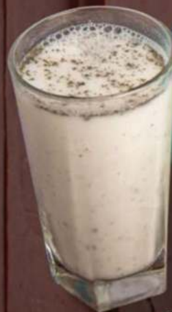
DOOGH (SALTY LASSI)