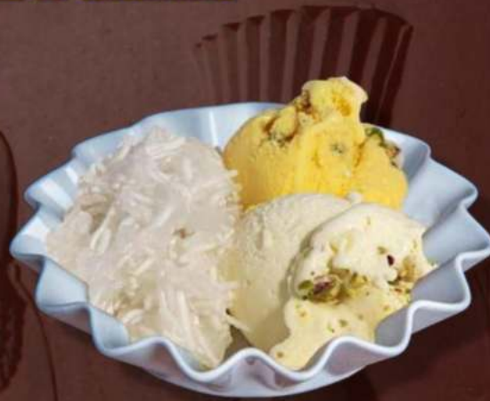
FALOODEH WITH PERSIAN ICE CREAM