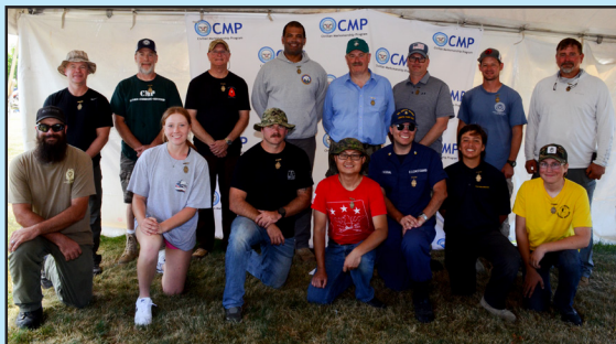
A group of competitors are recognized for their outstanding efforts in the Small Arms Firing School. This school offers an introductory match and EIC points are awarded to the top competitors.

The next step in learning about CMP program opportunities in your area is to familiarize yourself with our upcoming events list on the CMP Competition Tracker website, https://ct.thecmp.org . There, the CMP manages information for all its training and competition activities. For competitors, this page can be your entry point to a wealth of information – providing lists of CMP Affiliated clubs, upcoming matches and results from completed CMP sanctioned matches.