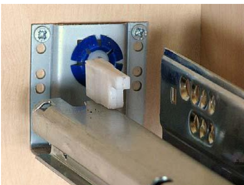
3. Back connection for Accuride-runner (incl. Adapter)