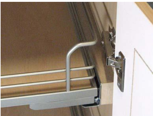
3. Fixing position »frameless«