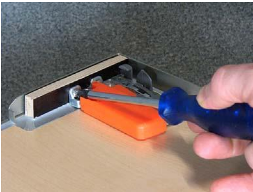
1. Screw the connection to the adapter (to required position – like a drawer)