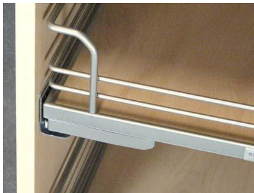
4. Fixing position »frameless«