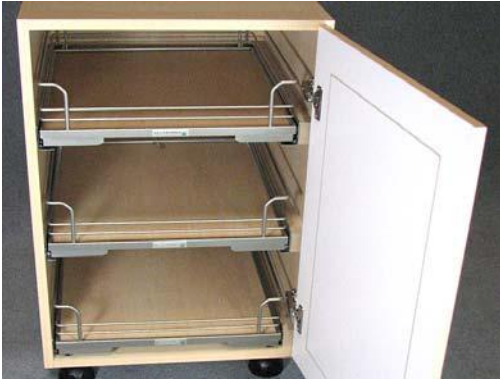
1. Face frame »inset«