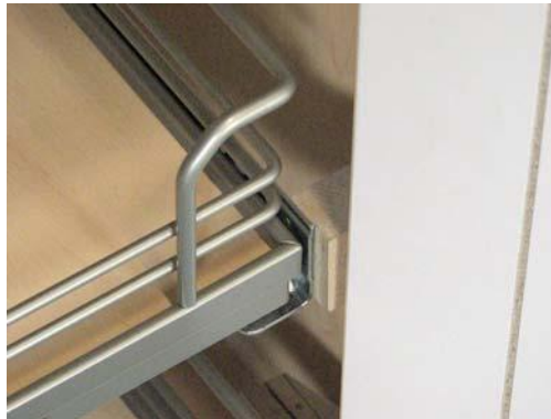
4. Fixing position »inset«