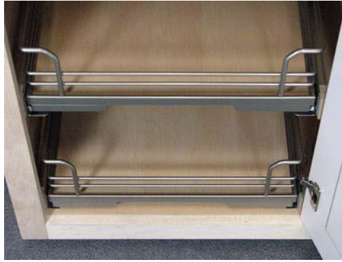
2. Fixing position »inset«