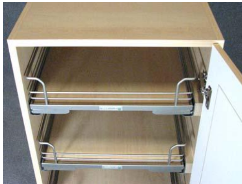
2. Fixing position »frameless«