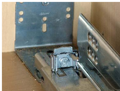
4. Back connection for Blum-runner