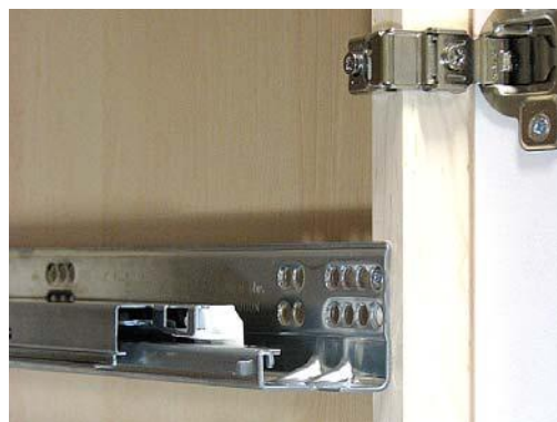
3. Fixing position »overlay«