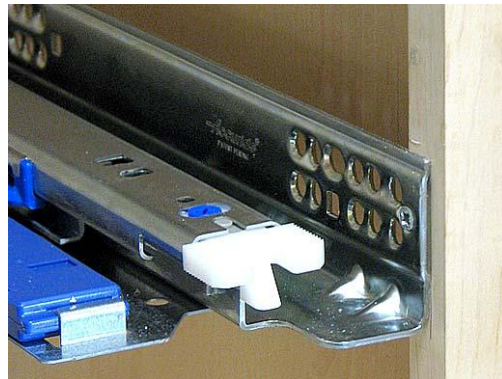
2. Fixing position »overlay«