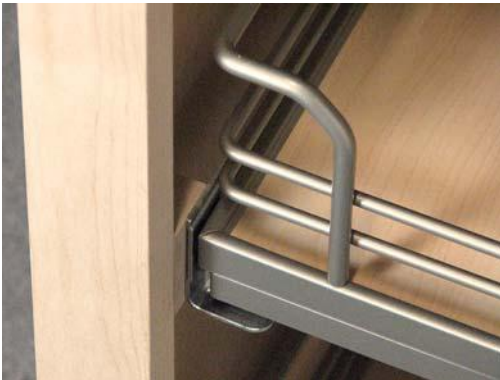
3. Fixing position »inset«