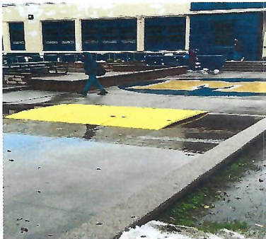
Puddles at MHS