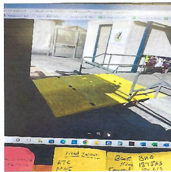
Accommodation of our handicap students