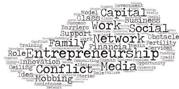
Fig. 1 The word cloud of search words

The geographical regions were selected on the basis of the Global Entrepreneurship Monitor (GEM) categorization. GEM is the world’s foremost research on entrepreneurship that assess national level of entrepreneurial activities annually and provides a large-scale database for international comparison [7]. The countries were grouped according to their geographical location