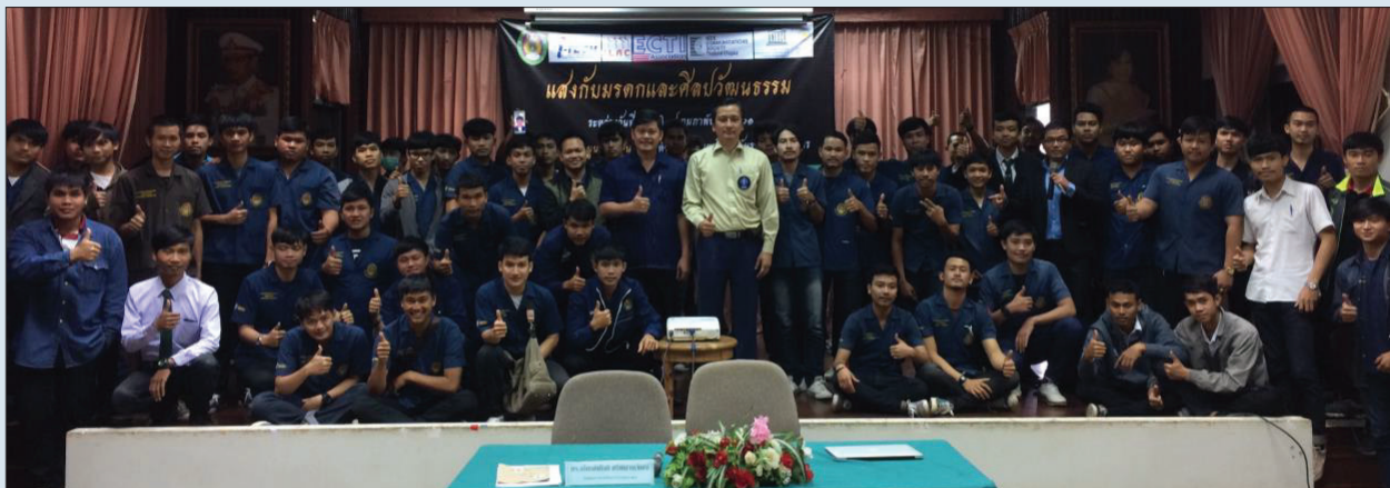
A seminar at MoonMung ISAN exhibition, Sakon Nakhon Rajabhat University.