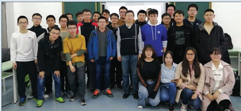
A freshmen class of Harbin Institute of Technology, China.