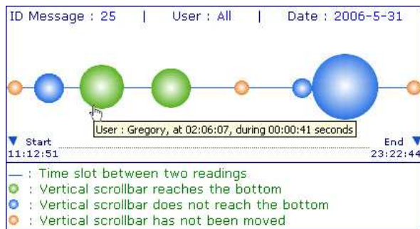
Figure2. Visualizing traces of « Reading a message in forum » in graphical representation

activities in different graphical representations by a simple request query. We give below an example of visualizing traces of an activity « Reading a message in forum ».