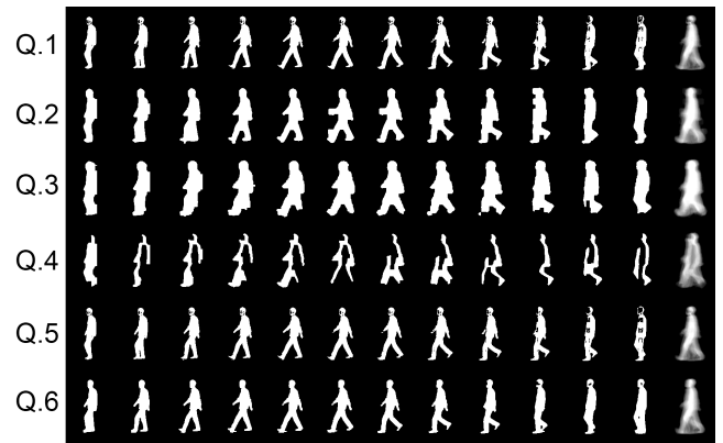
Fig. 2. Samples of gait silhouette and corresponding GEIs with different qualities (Q.1 to Q.6) for the same subject. For each row, the first 11 images are the binary silhouettes obtained after segmentation, while the rightmost image is the corresponding GEI.

Using the distinct segmentation approaches tabulated in Table I, each gait sequence can generate six sequences with