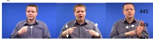
444 Figure 5.

439 to ask learners to copy signs with different levels of phonological difficulty and observe what 440 errors they make. Signs are not all equal in phonological complexity e.g. in the number of hands 441 with which they are articulated (1 or 2), the number of movement components they include, and 442 the motoric complexity of the handshape (Brentari, 1999). See figures 5 and 6 of BSL signs with 443 the simplest to the most complex phonological structure