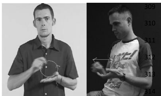
308 Figure 4 Iconic sign repetition

315 Target: TO-WRITE Learner: Handshape and movement error