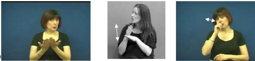
149 150 BOOK WORK SISTER

147 148 Figure 2. Examples of signs in BSL that vary in iconicity