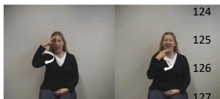
123 Figure 1. Phonological minimal pair in BSL