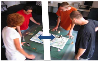
Figure 1: Working on distributed tangible surfaces.