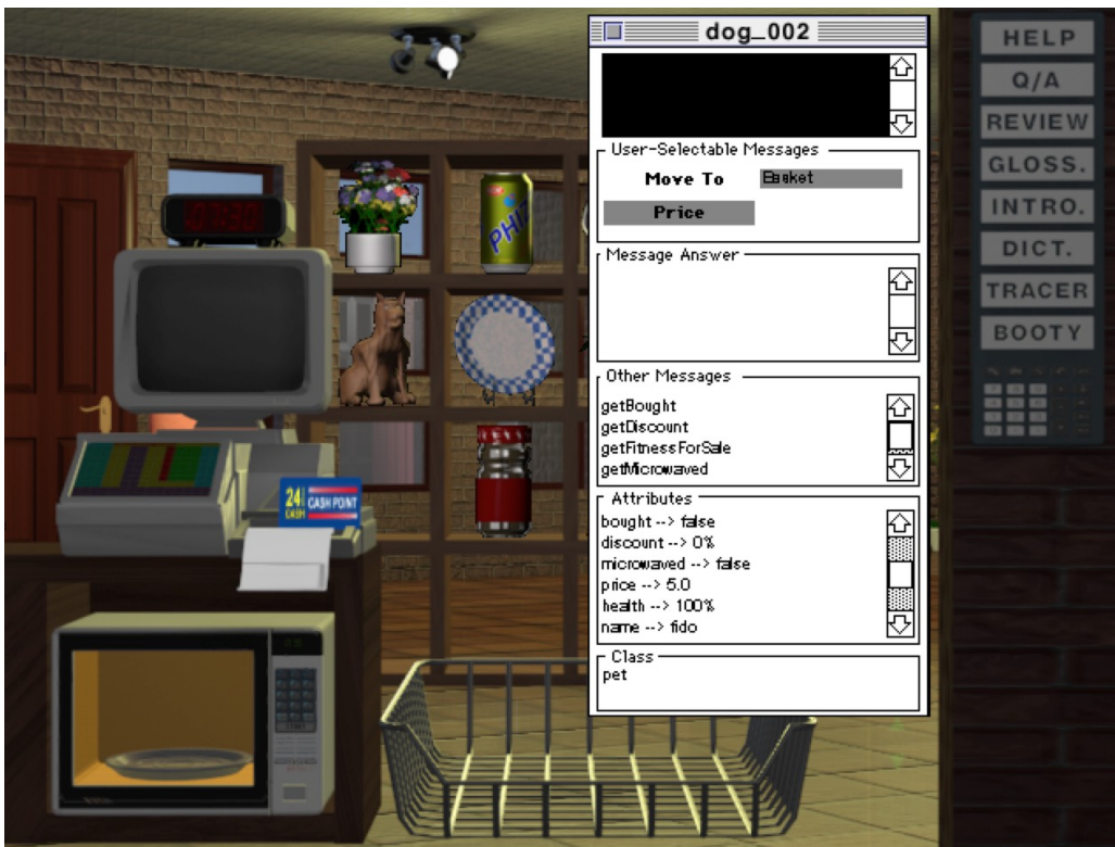
Figure 2: Floor 2 Articles In The Object Shop

candidates as one which would not demand an unnecessary 'knowledge overhead'. The task of shopping and bringing together (from a range of options) the items for a three course meal should be within the grasp of all possible students. Some illustrative domains (aircraft control, vehicle ignition systems, air conditioning systems) required significant background knowledge of the domain in order for the user to interact in any significant manner. The designers also had to keep in mind whether the illustrative domain would appeal to all age ranges and both genders (or at least not alienate any one group).