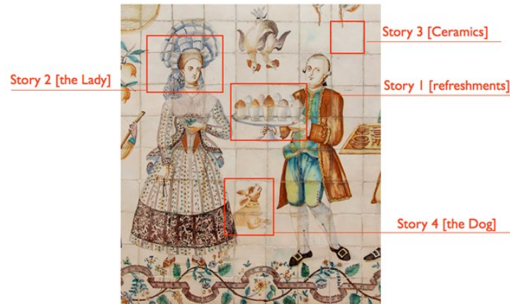
Figure 2. The stimulus image, highlighted sections correspond to the audio narration.