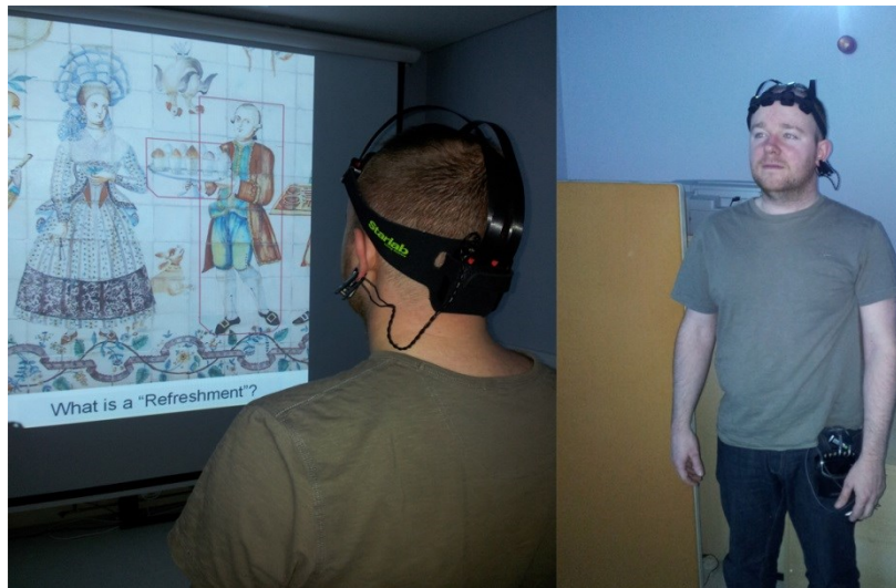
Figure 3. Participant wearing sensor hardware

Instruction about the experimental procedure was given and participants were asked to complete a consent form in accordance with the approval of the University Research Committee, and then fitted with a mobile pouch to hold the Nexus sensor hardware at the hip. Electrodes for ECG and SCL were placed on the torso and fingers, a Biosemi sensor cap was fitted to the participant to ensure correct sensor placement (see Table 1.) and electrodes attached. Participants were asked to stand in a relaxed position in front of the projection screen (shown in Figure 3.). This was followed by the audio-visual presentation of the Valencia kitchen.