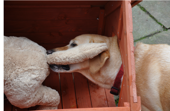
Figure 2: A dog smells a synthetic anus to prove they are a dog

Dog CAPTCHA saw a refinement of the Dog Internet, and a focus on the mechanics of how a dog might use a computer network, focusing on security and privacy infrastructure. This led to the construction of a wooden kennel as an interface to the dog internet, where the species of the user was