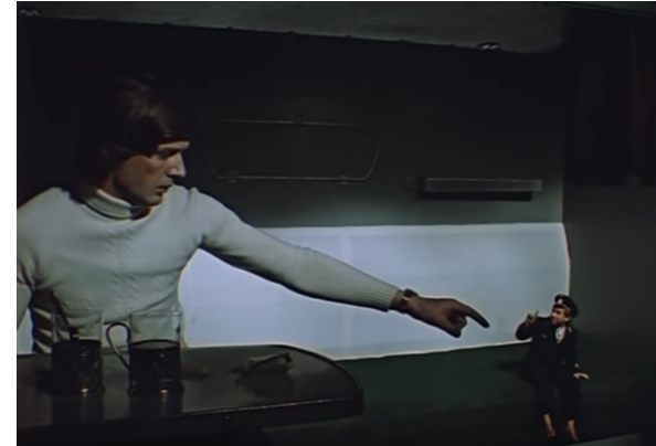
Figure 3: Still from Charodei [9], a 1982 TV adaptation.

"Monday" is an interesting book because the main themes are around academia and academic working in the space of emerging technology. The book is a series of vignettes set in the (Soviet) National Institute for the Technology of Witchcraft and Thaumaturgy (NITWITT), a research organisation that deals with the investigation of the fantastical.