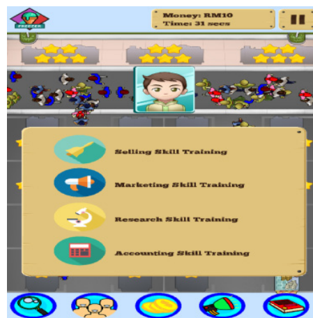
Fig. 7. Staff training overlay