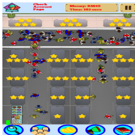
Fig. 2. Warning message on payment overdue