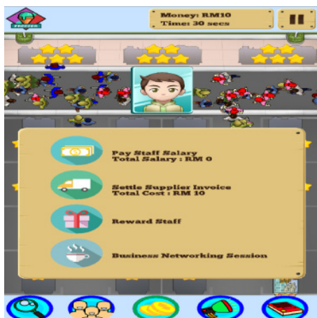
Fig. 8. Accounting overlay