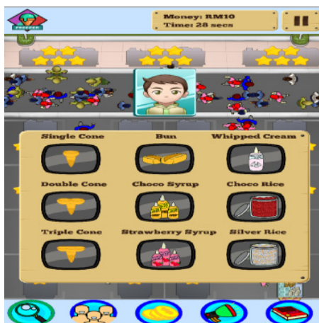
Fig. 6. New product research overlay