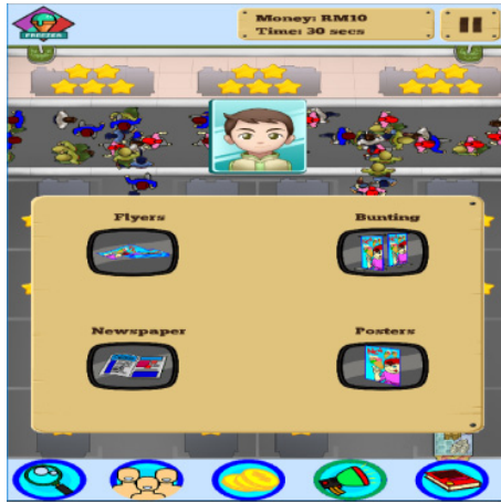
Fig. 3. Marketing overlay selection