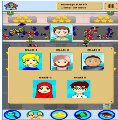
Fig. 5. Hiring new staff overlay