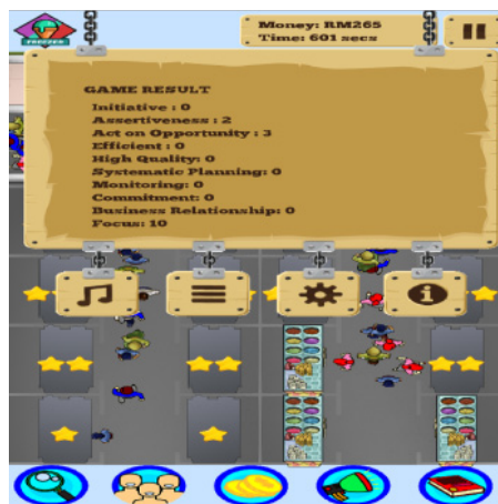
Fig. 9. Game result overlay

In order for the 'Freezer' mobile game application to be used widely, future research may look on further validation for respondents from different backgrounds to make sure 'Freezer' can be used by any age group. Interface for 'Freezer' needs further improvement to be more intuitive with less time spent for first time users in understanding the game's mechanics.